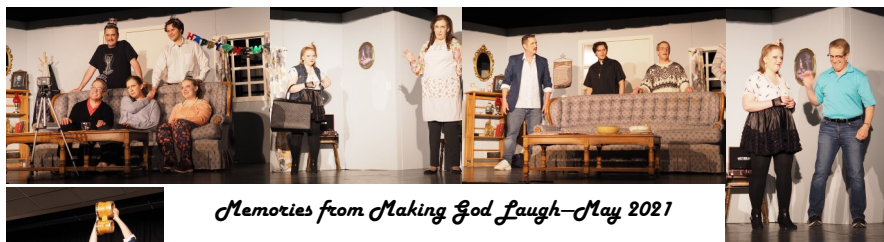
Memories from Making God Laugh - May 2021

There's nothing quite like seeing your vision brought to life on the stage by our many talented volunteers. If it's been your dream to unleash your imagination before the Florence faithful, we'd love to see it through! Our email inbox is waiting for you!